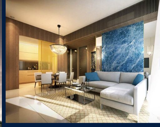
3 - Bedroom Unit