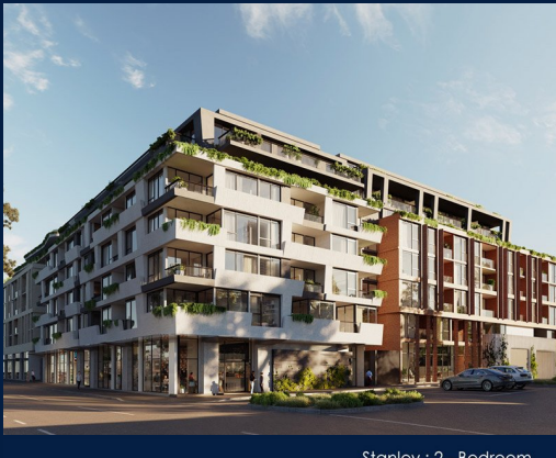
Stanley: 2 - Bedroom