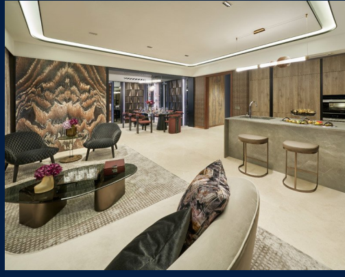
5 - Bedroom Premium