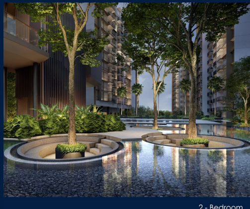
2 - Bedroom