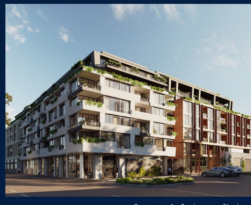
Spencer: 1 - Bedroom + Study